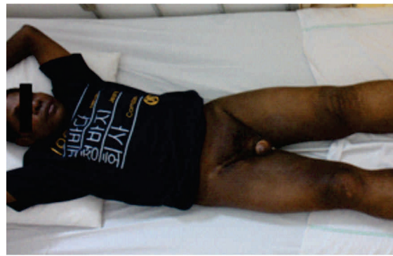
Figure 6. Post Operation

Lymphatic filariasis, commonly known as elephantiasis, is a neglected tropical disease. It is most commonly caused by Wuchereria bancrofti , accounting for 90% of all cases. Other causative agents are Brugia malayi and Brugia timori . Infection occurs when filarial parasites are transmitted to humans through mosquitoes. Infection is usually acquired in childhood causing hidden damage to the lymphatic system leading to the second leading cause of permanent and long-term disability after leprosy. These patients are not only physically disabled, but also suffer mental, social and financial losses contributing to stigma and poverty. Indonesia is one of the ten most endemic country for lymphatic filariasis. 1 It is uncommon for a patient with such giant scrotal elephantiasis to come to health care professionals even in endemic region for filariasis. 2 This is an interesting case to learn about lymphatic filariasis as a differential diagnosis for genital swelling mainly scrotal tumor and incarcerated herniation.