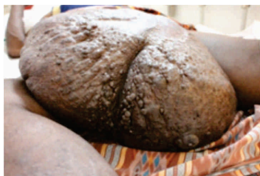
Figure 3. Giant hydrocele