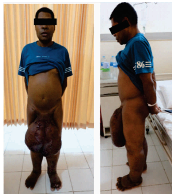
Figure 2. Standing position