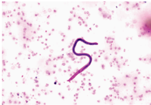
Figure 5. Giemsa staining of sheathed microfilaria Wuchereria bancrofti with the tail end does not contain any nuclei