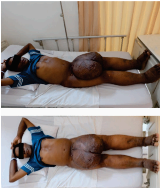
Figure 1. Lying position