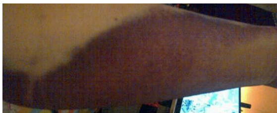
Figure 1. Ecchymosis on left forearm.

patient was hospitalized on December 22nd, 2015 for three days and was treated with recombinant factor VIII 1500 IU/day. The next examination (December 28th, 2015) showed that factor VIII activity decreased after recombinant factor VIII therapy despite the diminishing symptoms of ecchymosis ( Figure 2 ).