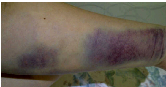
Figure 2. Ecchymosis on left forearm after recombinant factor VIII therapy.

patient was hospitalized on December 22nd, 2015 for three days and was treated with recombinant factor VIII 1500 IU/day. The next examination (December 28th, 2015) showed that factor VIII activity decreased after recombinant factor VIII therapy despite the diminishing symptoms of ecchymosis ( Figure 2 ).