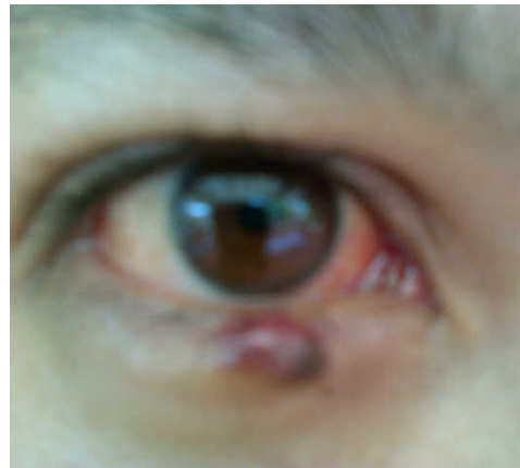
Figure 2. Kaposi sarcoma lesion was improved approximately within 1.5 months of Truvada® (emtricitabine and tenofovir disoproxil fumarate) and efavirenz therapy